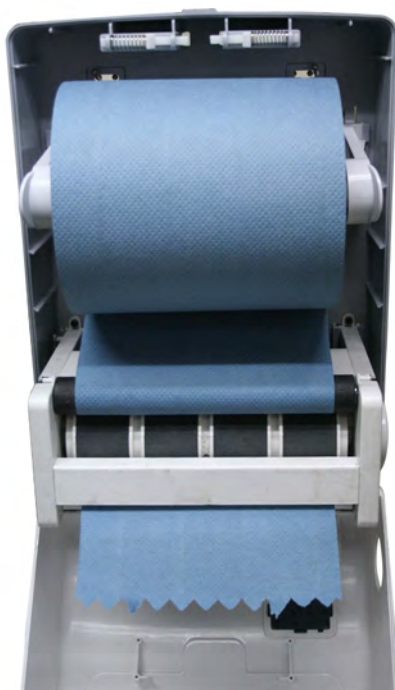
Hold widths of towels from 190 - 210mm

4 pcs/carton, Carton : 64.5 x 42.5 x 55.5 cm; G.W. 20kgs; N.W. 15.2 kgs; 740 pcs / 20 ft container