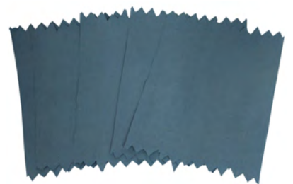
Output towel ( 25 cm long )