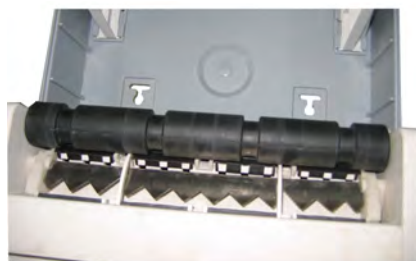
stainless steel rotating knife